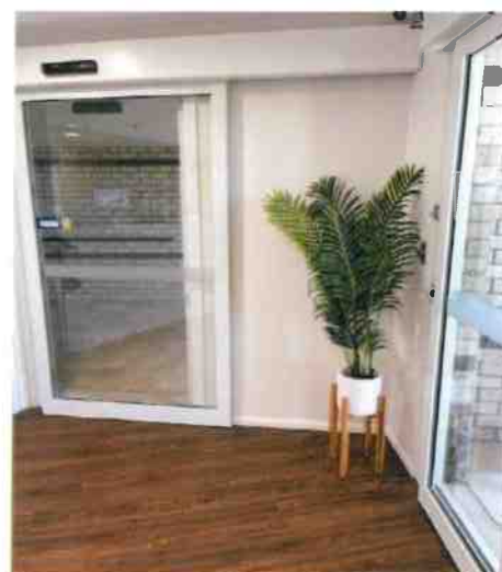
Reception Waiting Area