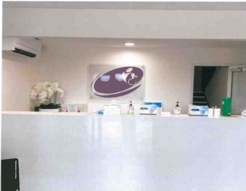
New sign at Reception

The second floor is now renovated. The HR office, IT and Management office have all moved into the old conference room new office space. The tiles have been replaced from reception through to the staff room and beyond. The progress so far can be seen in the photos below.