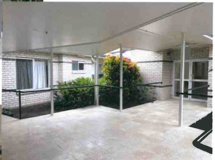
Tile Refurbishment Walkways and Entrance