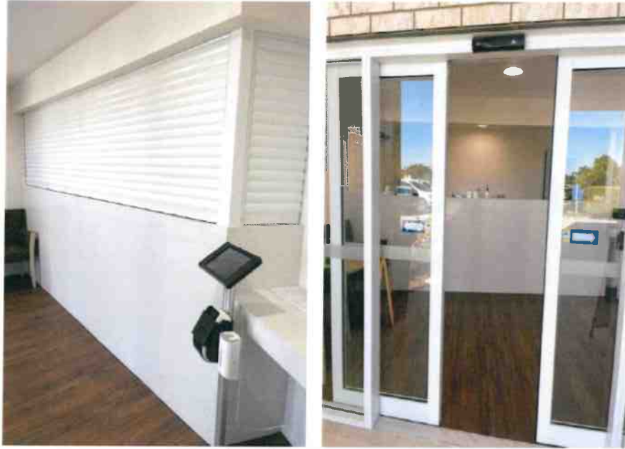
Front Entrance with Roller Shutters and Automatic Doors