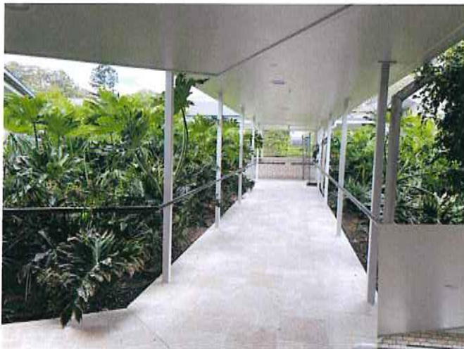
Tile Refurbishment Walkways and Entrance