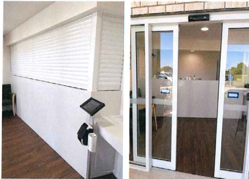
Front Entrance with Roller Shutters and Automatic Doors