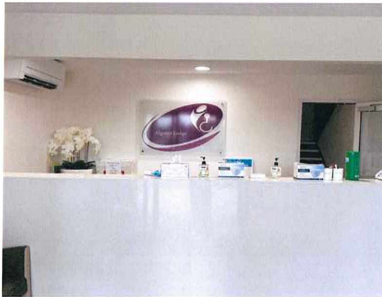
New sign at Reception

The second floor is now renovated. The HR office, IT and Management office have all moved into the old conference room new office space. The tiles have been replaced from reception through to the staff room and beyond. The progress so far can be seen in the photos below.