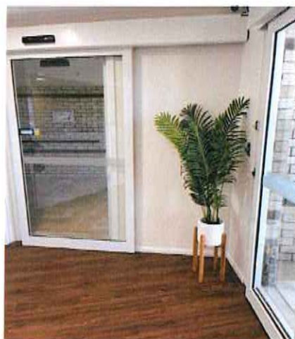
Reception Waiting Area